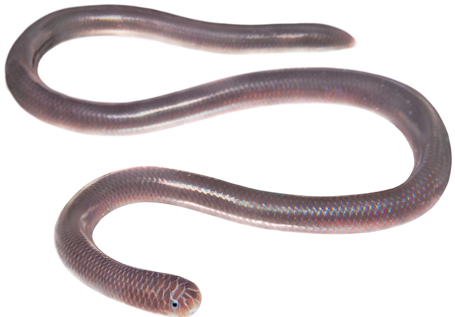
Figure 3. Adult individual of Indotyphlops braminus from Capeira, Guayas province, Ecuador.