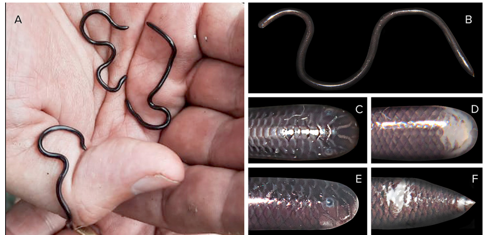
Figure 4. Individuals of Indotyphlops braminus from Capeira, Guayas province, Ecuador. A. Three living individuals on a researcher's hand to show size. B–F. Detailed views of a specimen: (B) aspect of body of an uncollected specimen; (C) dorsal view of the head; (D) ventral view of head; (E) lateral view; (F) ventral view of tail.

Mundo-Samboyondón; –02.1324, –079.8653; 11.II.2020; Pérez Correa Julián obs.; https://www.inaturalist.org/observations/38539523 • Urb. Bouganville-Samboyondón; –02.1309, –079.8663; 09.I.2016; Camacho Jaime obs.; https://www.inaturalist.org/observations/2575602 .